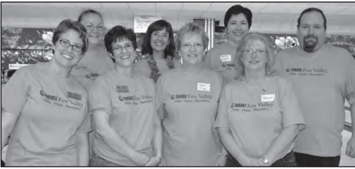
NAMI Fox Valley staff sport their new green t-shirts on the day of the bowl-a-thon.