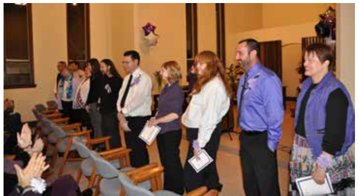
The graduates receive a round of applause at the Jan. 8 graduation ceremony.

"You can't buy life experience or the honesty and compassion that comes with peers helping peers. Enduring what we have endured so that we can help others is so powerful, and is essential to the growth and the gradual incline that recovery stands for. There is beauty in being who we truly are and breaking the chains of being defined by our mental illness. Everyone has choices. Life came at us with heartbreak and lack of hope, and we still choose to fight. That fight and our mission isn't over; after today, we fight for others and keep their hope alive."