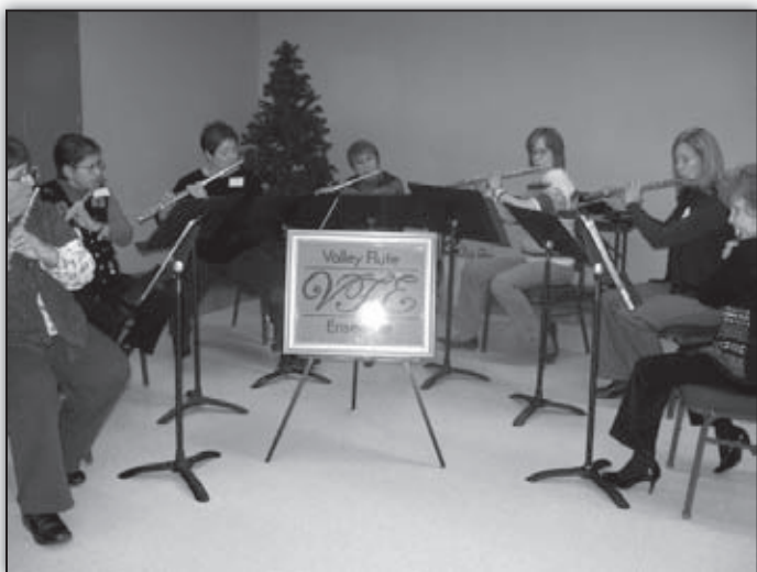
Valley Flute Ensemble