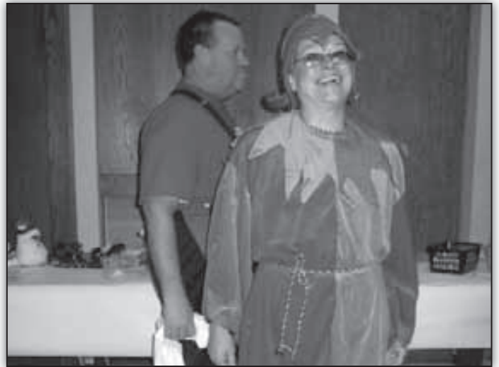
Georgie the Elf