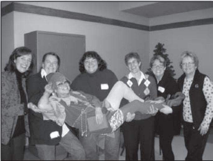
We're all supportive of Georgie the Elf!