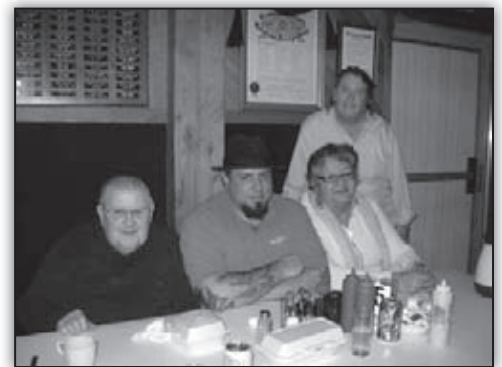
Veterans' group eating at the VFW